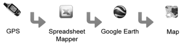
Figure 2 Sanitation Mapper visual

Figure 2 provides a visual illustration of the Sanitation Mapper data analysis for settlements within Ward 15 of Dhaka city. The map shows an analysis of each latrine with the number of people accessing the facility. Each latrine icon on the map contains photos of the facility and associated information.